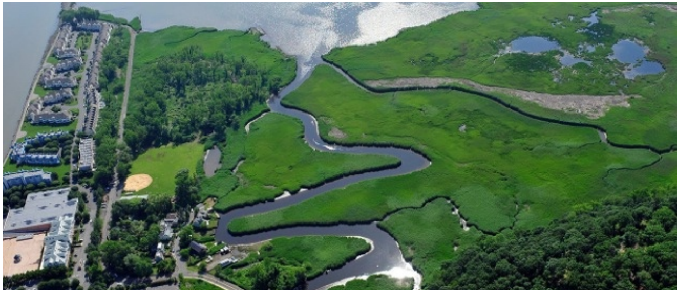
Piermont Marsh - Hudson River National Estuarine Research Reserve.