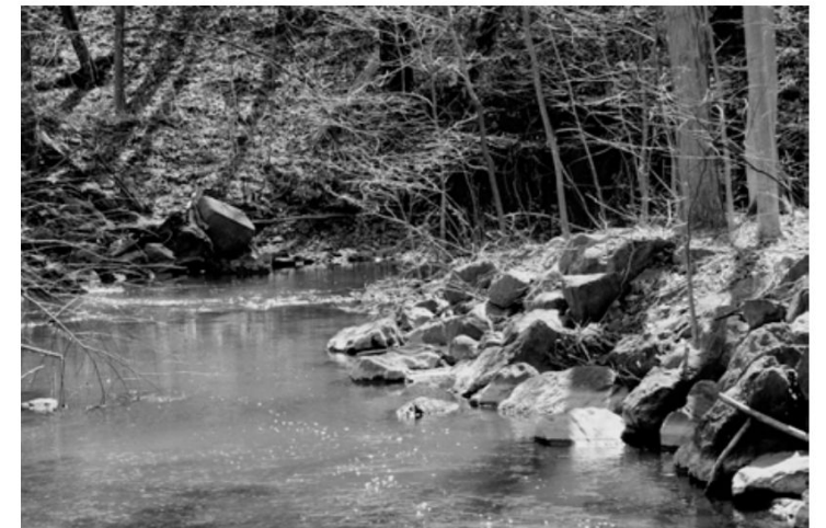
Photo taken at the site where Rt. 9 crosses the Casperkill

Vassar College Environmental Research Institute Cornell Cooperative Extension (CCE) Environment Program Casperkill Watershed Alliance