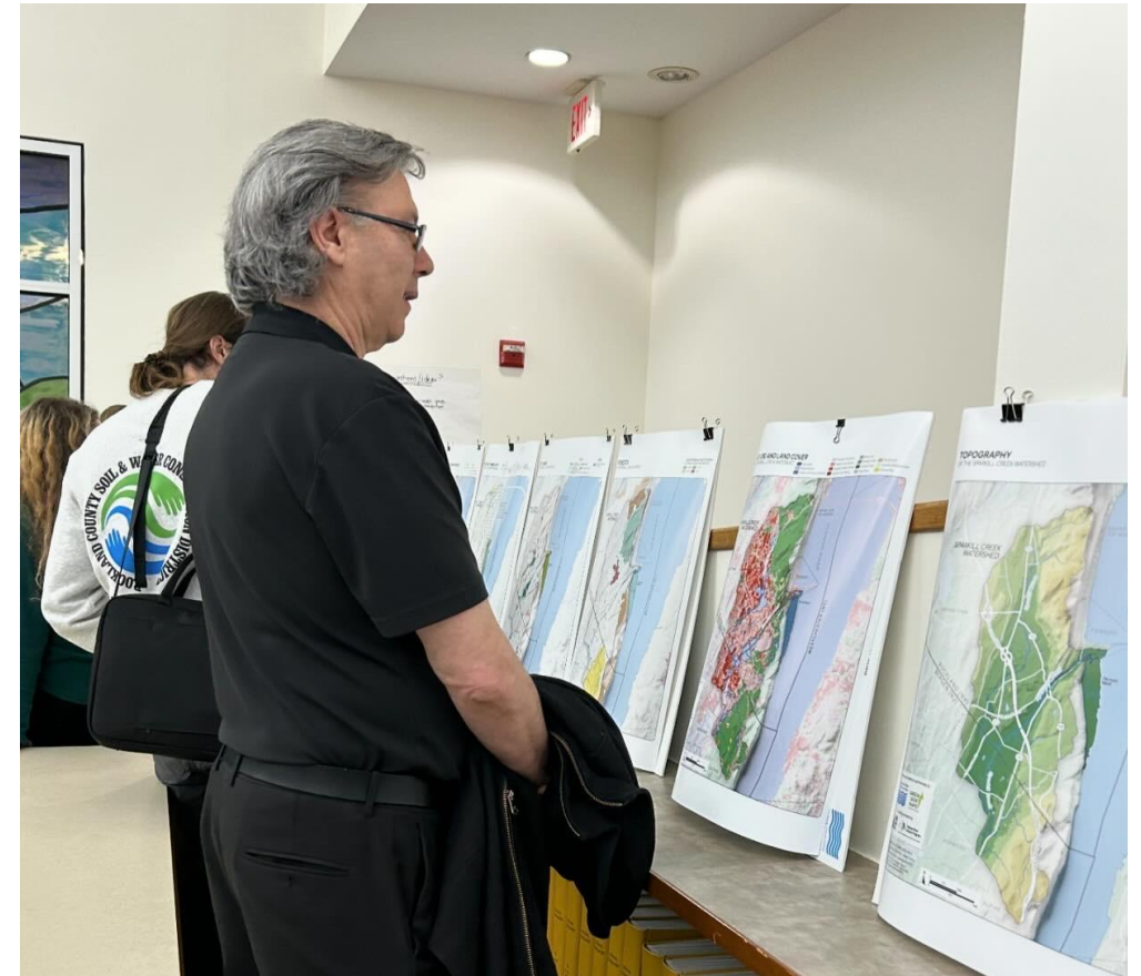
Sparkill Creek Watershed Characterization Community Presentation