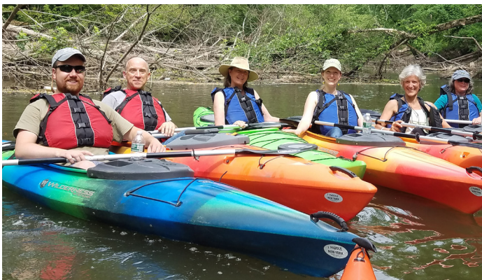
Watershed partners kayaking on the Esopus Creek, after a roundtable to share information and insights.