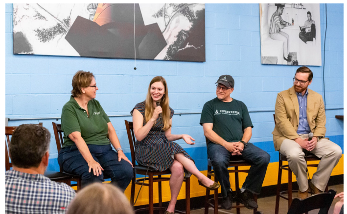
Panel discussion on the Hudson River

We brought Pace University's award-winning land use training to local leaders from 6 municipalities in Albany County . We held a follow up workshop to further discuss watershed issues and opportunities.