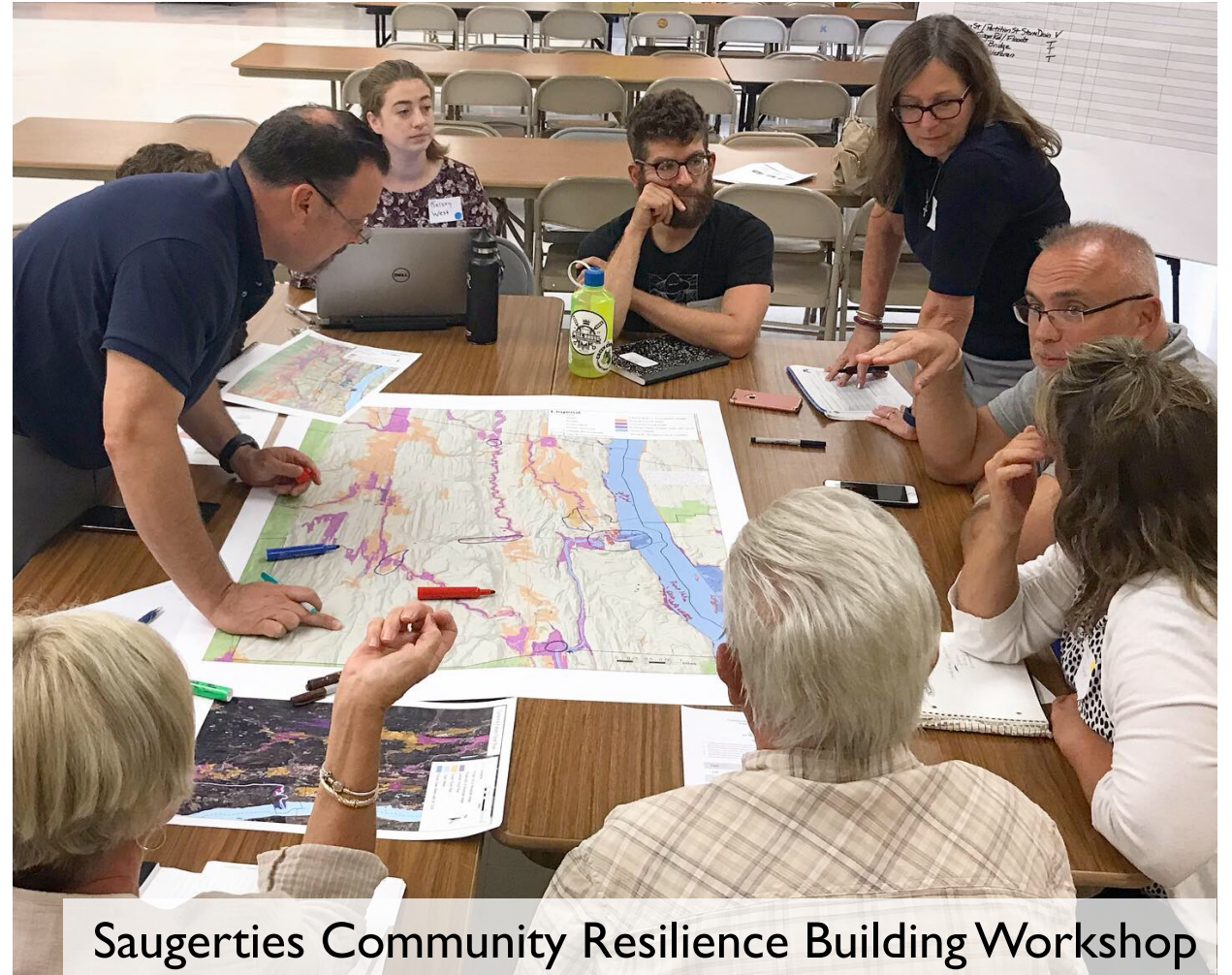
Saugerties Community Resilience Building Workshop