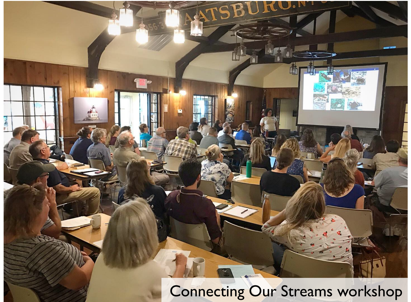
Connecting Our Streams workshop