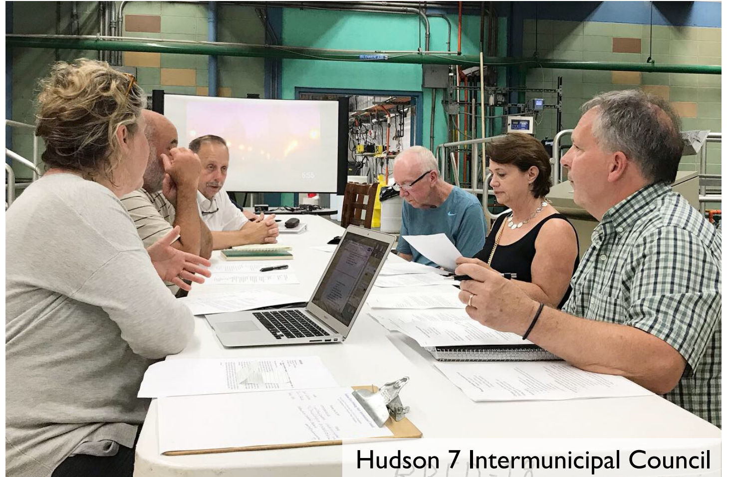
Hudson 7 Intermunicipal Council