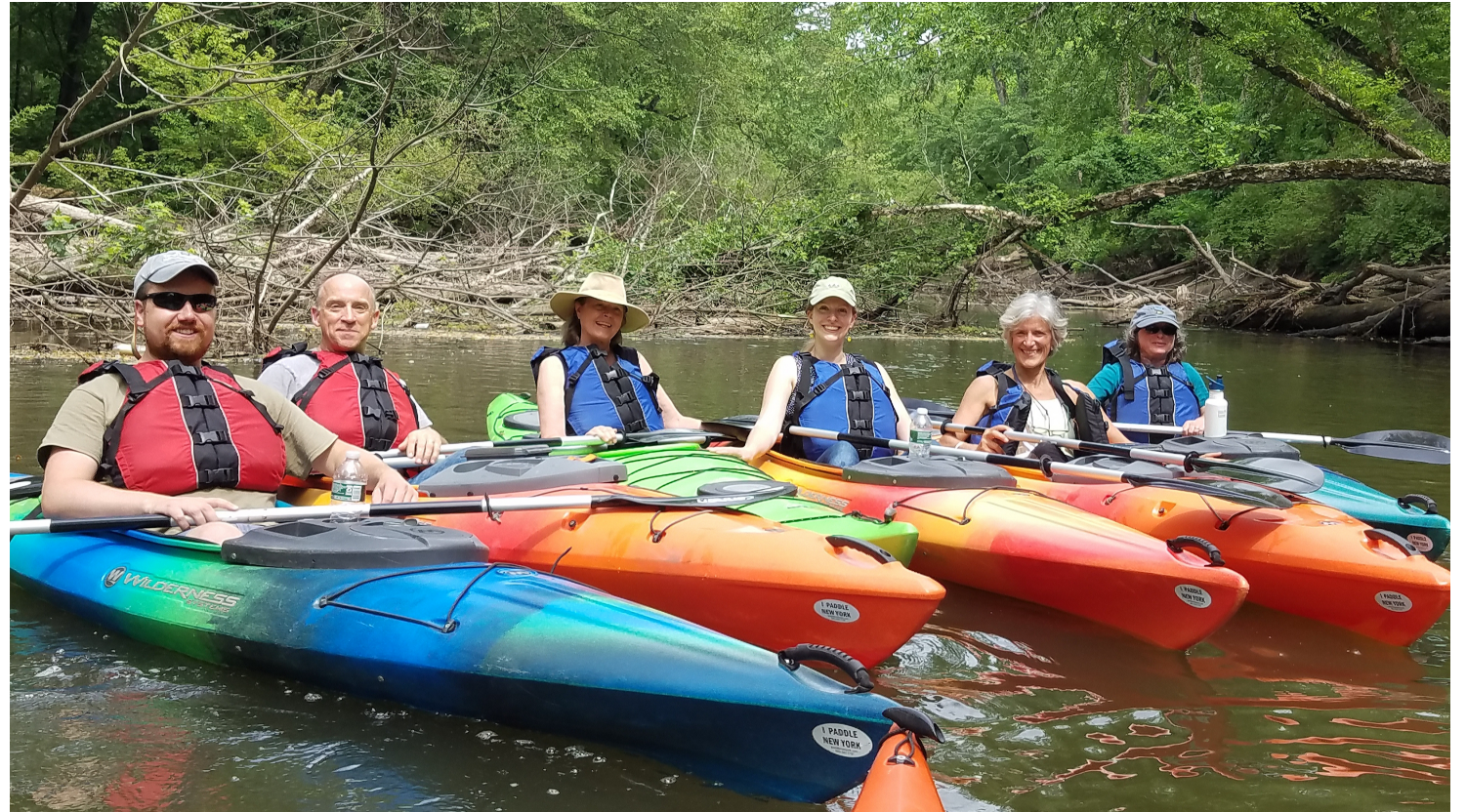
June Watershed Roundtable