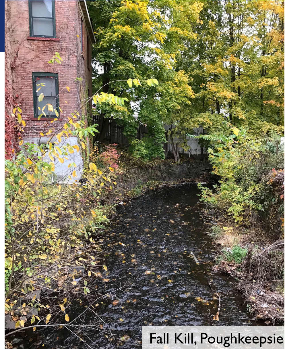
Fall Kill, Poughkeepsie