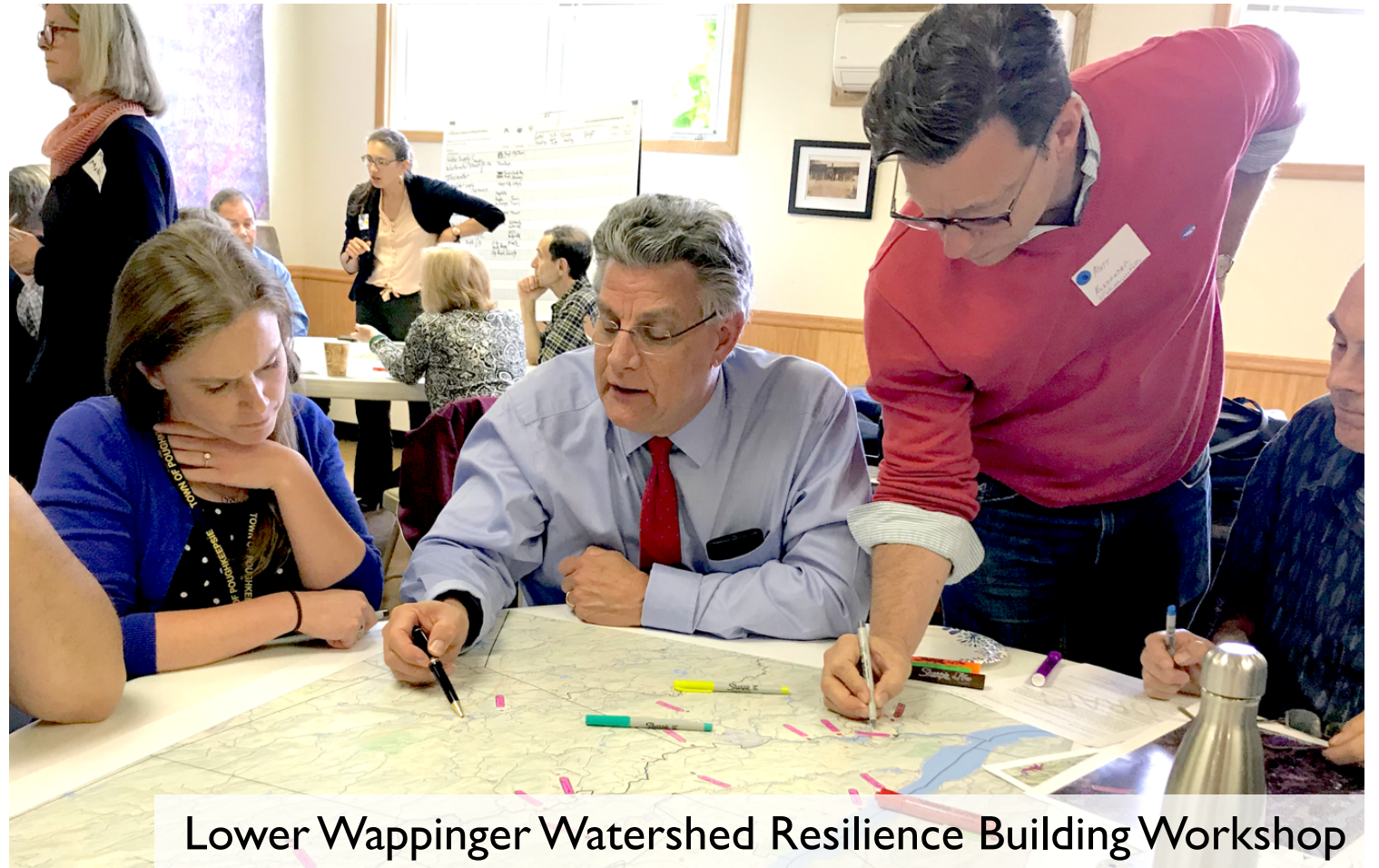
Lower Wappinger Watershed Resilience Building Workshop