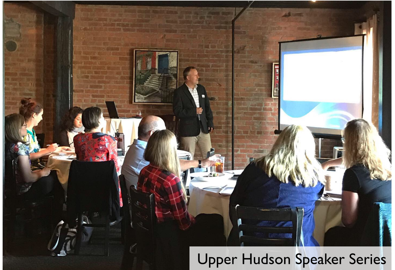
Upper Hudson Speaker Series