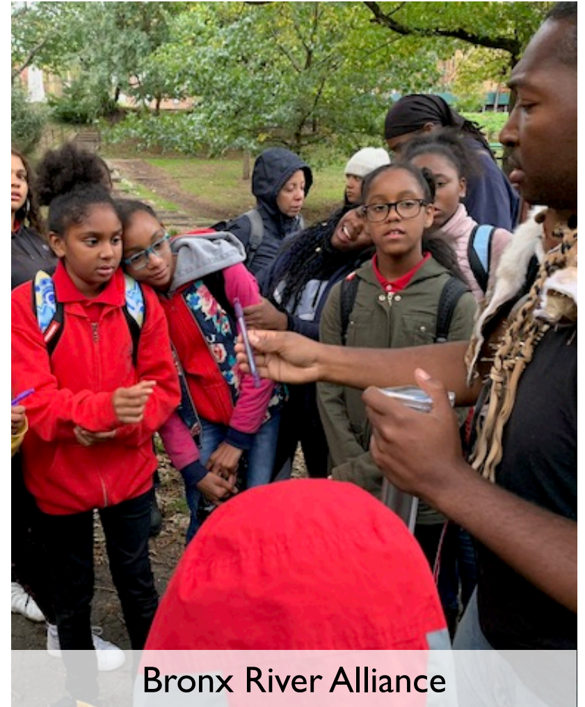
Bronx River Alliance