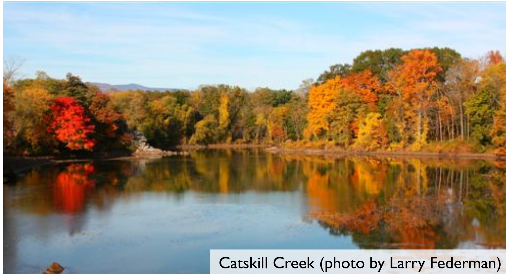
Catskill Creek