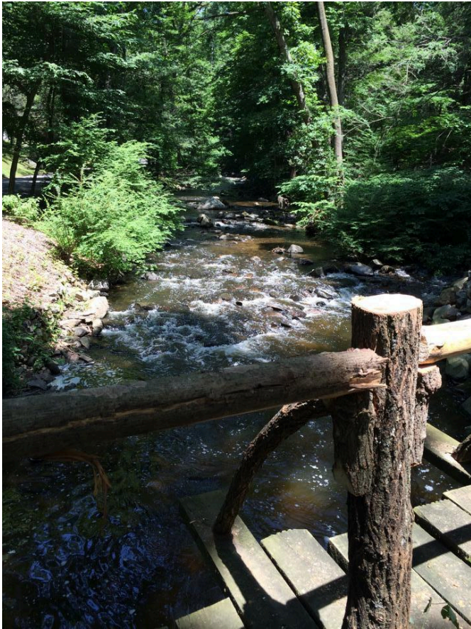
Pocantico River from Horseman Bridge in Sleepy Hollow Cemetery.

The current Pocantico River watershed group was kicked off with a roundtable meeting on September 16, 2014 hosted by the Rockefeller State Park Preserve, the NYS DEC Hudson River Estuary Program and the Hudson River Watershed Alliance and attended by additional representatives from the Village of Sleepy Hollow, the Town of Mount Pleasant, Westchester County, Pace University, Riverkeeper, Trout Unlimited and others. In an initial survey of meeting participants, various goals were identified for the Pocantico by this group: to improve water quality and habitat; to improve fish, bird and invertebrate habitat; to document and restore migratory fishes; to enhance human use of the resource; to coordinate land use plans to enhance watershed quality; to fill data gaps; to raise awareness about fecal contamination; to reduce bacterial contamination; to prompt local involvement and action; and to facilitate sustained and coordinated funding of long-term studies. Following this first